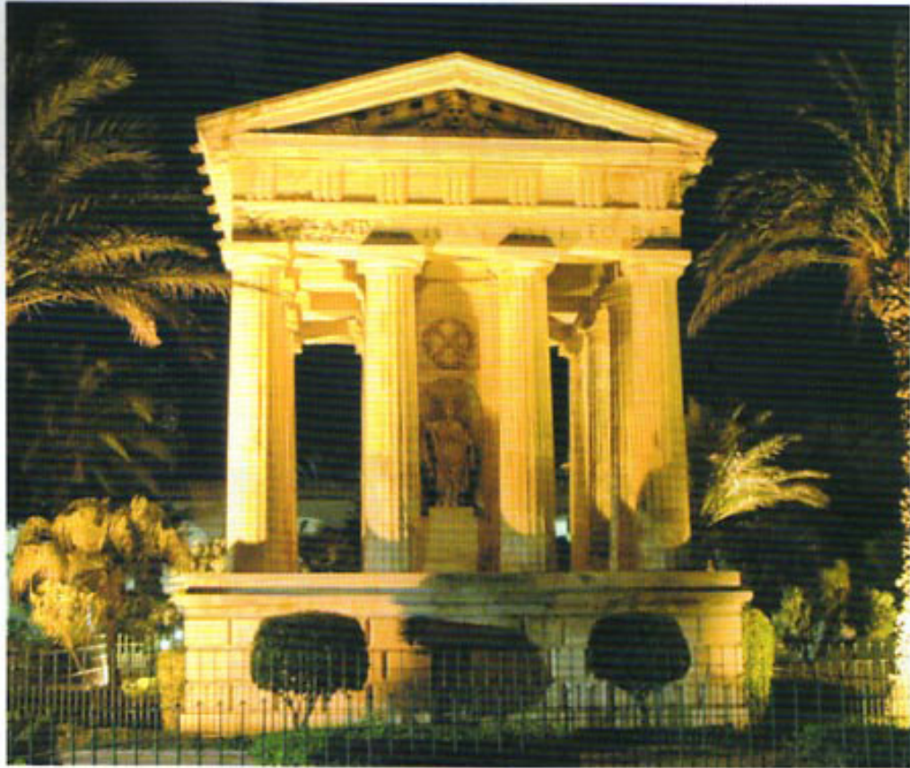
Evening scene at Valletta’s Lower Barrakka Gardens, site of a sepulchral monument to Sir Alexander Ball, first British Governor in Malta.

“And for the amount of visiting people that come to Malta every year I was thinking there was a market here because back in England that’s what I do for a living.